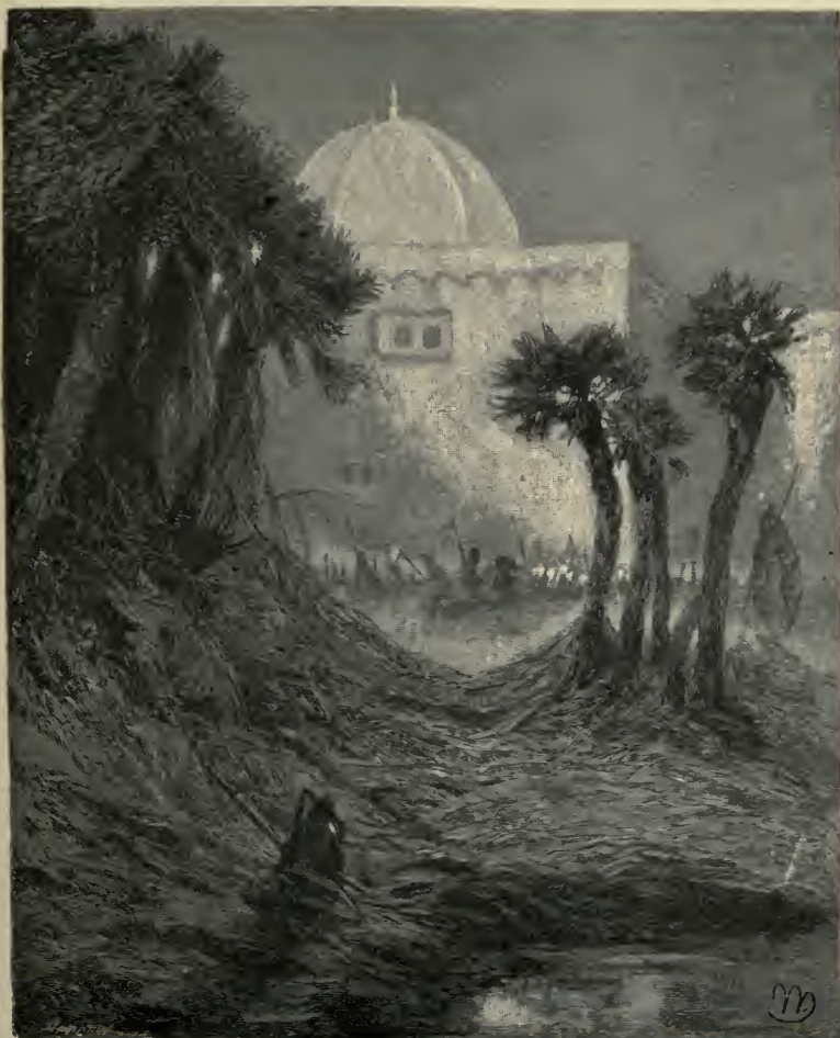
"WHEN THE SULTAN GOES TO ISPAHAN." Page 66.